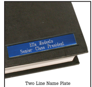
Two Line Name Plate