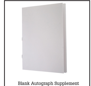
Blank Autograph Supplement

Columbian Yearbook c/o Marshall High School 7731 Leesburg Pike Falls Church, VA 22043 columbianyearbook@gmail.com 703-714-5511